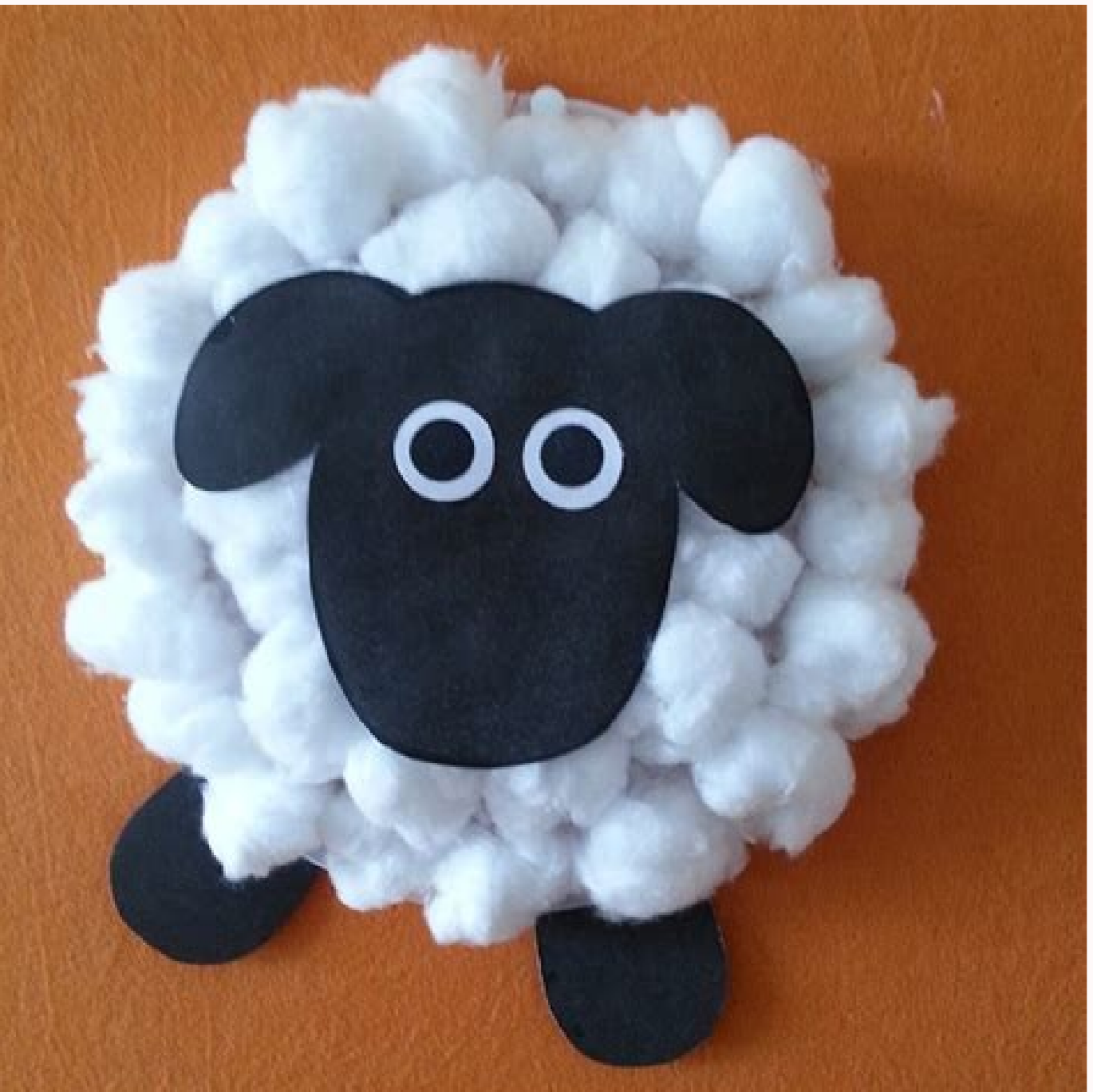
Crochet projects for cotton yarn. How to make a 3d sheep with cotton balls.